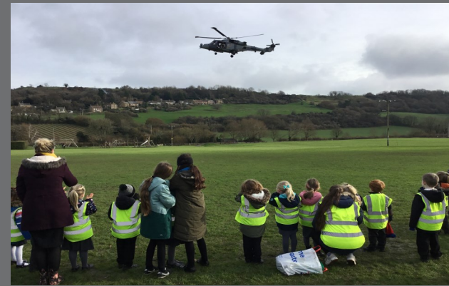
Santa Helicopter visit