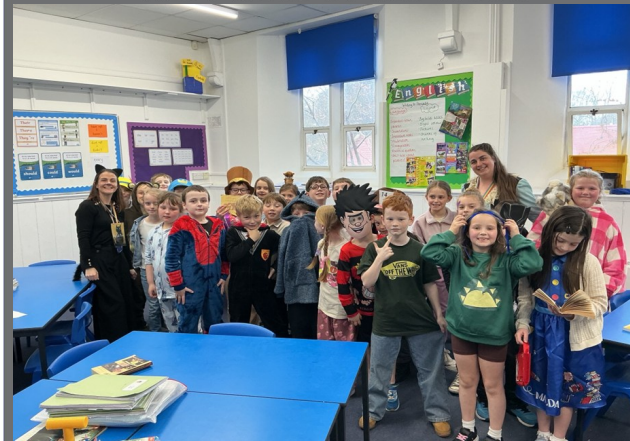
World Book Day—Totnes Class